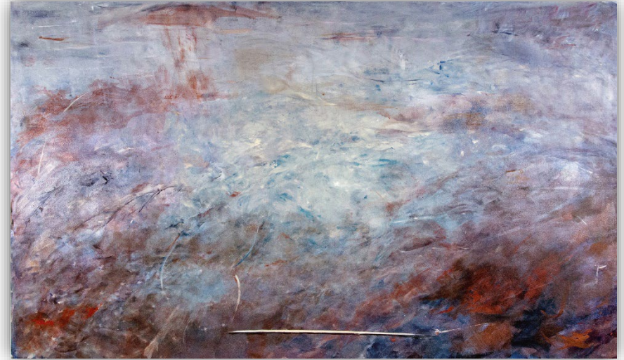
Finding the Eternal in the Everyday. 58 x 101 inches. Acrylic on Canvas.

OCEAN VASTNESS: These two paintings are from a series that respond to the vast power and scale of the ocean in relation to our human lives.