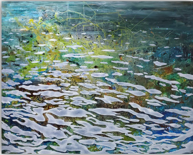
Coastal Surface: Communities. 48x60 inches. Acrylic and Oil on Canvas.

SYNERGY PAINTINGS: These two paintings were inspired by Noah Paul Germolus' ongoing ocean chemistry research on two forces that compete for essential molecules in the upper ocean: the microbes that produce and consume these nutrients, and the ambivalent mechanisms of chemistry that alter or destroy them. Each is informed by high-resolution chemical measurements from a specific collection zone, as well as knowledge about the contemporaneous physical and microbial characteristics.