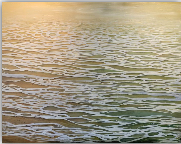
Ocean Surface: Loneliness. 48x60 inches. Oil on Canvas.

LEFT: Active water, full of movement, rich with vibrant mixtures of both land-derived molecules and oceanic molecules. An ever-changing mix of molecules, where nutrients are amplified by pollutants, pharmaceuticals, and other human activity.