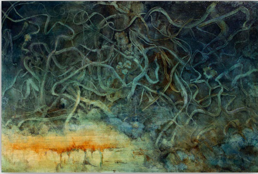
Two Worlds. 24 x 36 inches. Oil on Panel.

LEFT: This painting references the two worlds of land and sea touching at an uneven border, and suggests coastal erosion. Borderlands are “in a constant state of transition” and are the places where change occurs.