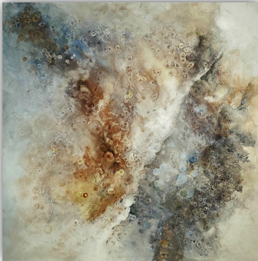
Where Waters of the Heart Push Their Tides. 36x36 inches. Acrylic on Canvas.

LEFT: This painting references the two worlds of land and sea touching at an uneven border, and suggests coastal erosion. Borderlands are “in a constant state of transition” and are the places where change occurs.